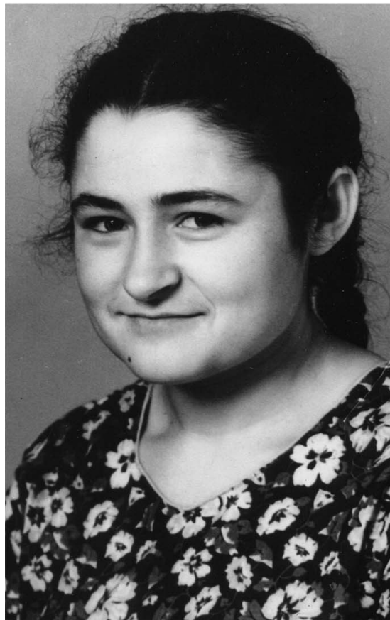
Bella Subbotovskaya, 1961.

The goal of the conference is to bring together researchers studying various forms of complexity (in the most general sense of this notion and not only the algorithmic complexity) in mathematics and mathematical physics. 1 In memory of Bella Subbotovskaya, a mathematician, who worked in the algorithmic complexity theory, and an unknown hero of Soviet mathematics.